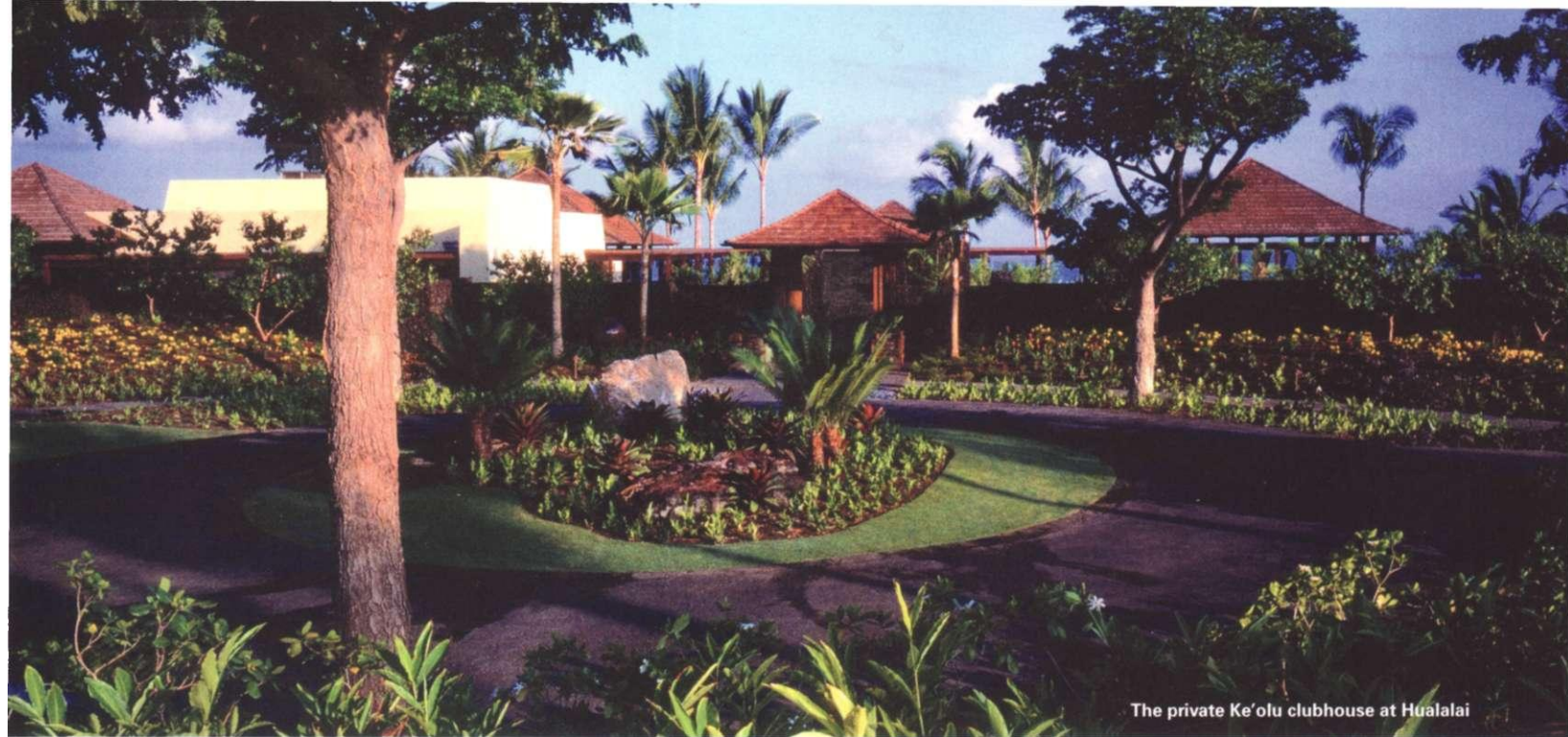
The private Ke'olu clubhouse at Hualalai