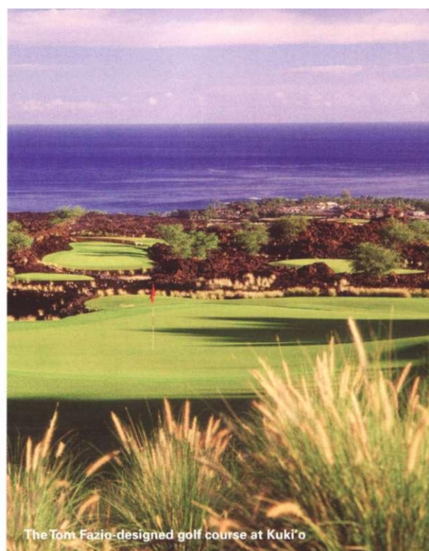
The Tom Fazio-designed golf course at Kuki'o

Just down the Kohala Coast toward the main town of Kona, the Four Seasons Hualalai Resort is home to numerous business tycoons and the prestigious PGA Champion Tour's MasterCard Championship. "Hualalai embodies the quality that has become synonymous with the PGA Tour," says PGA Tour Commissioner Tim Finchem. "We are pleased to be associated with what is recognized as one of the finest resorts in the world."