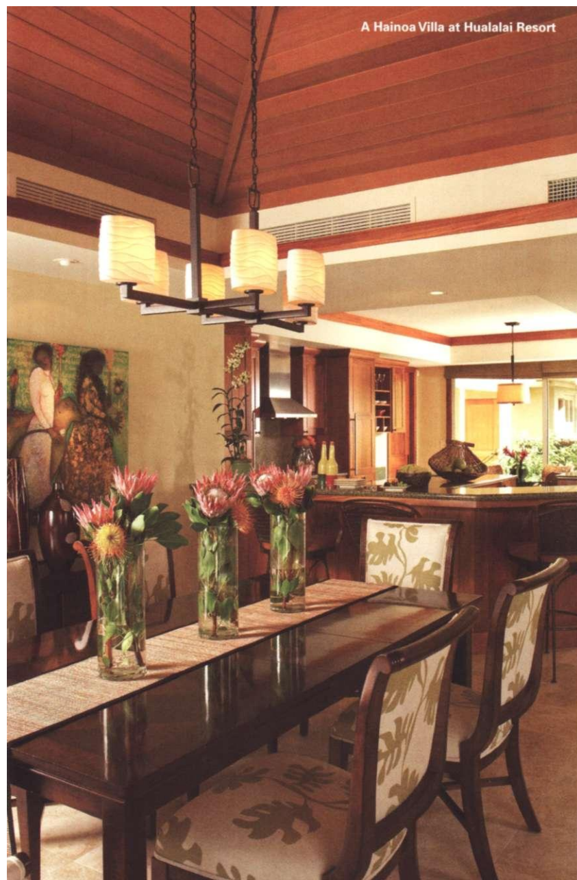
A Hainoa Villa at Hualalai Resort