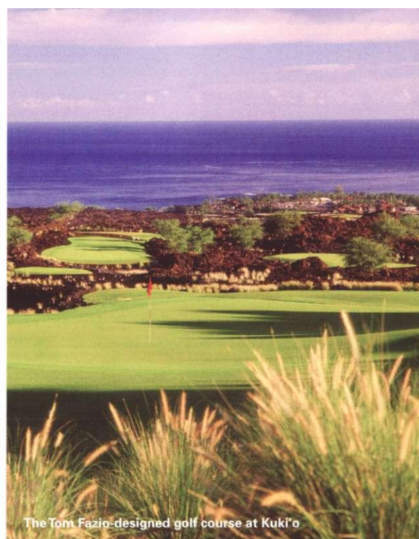
The Tom Fazio-designed golf course at Kuki'o