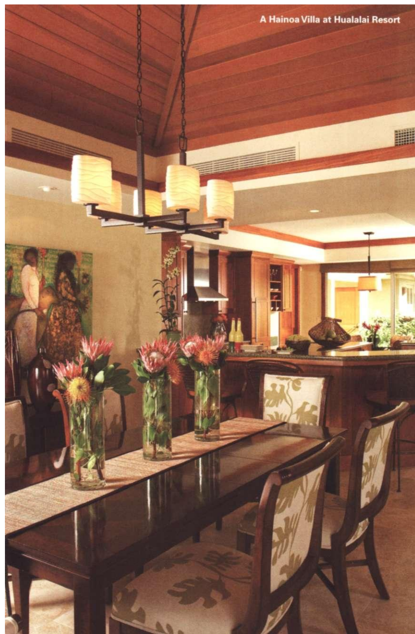
A Hainoa Villa at Hualalai Resort