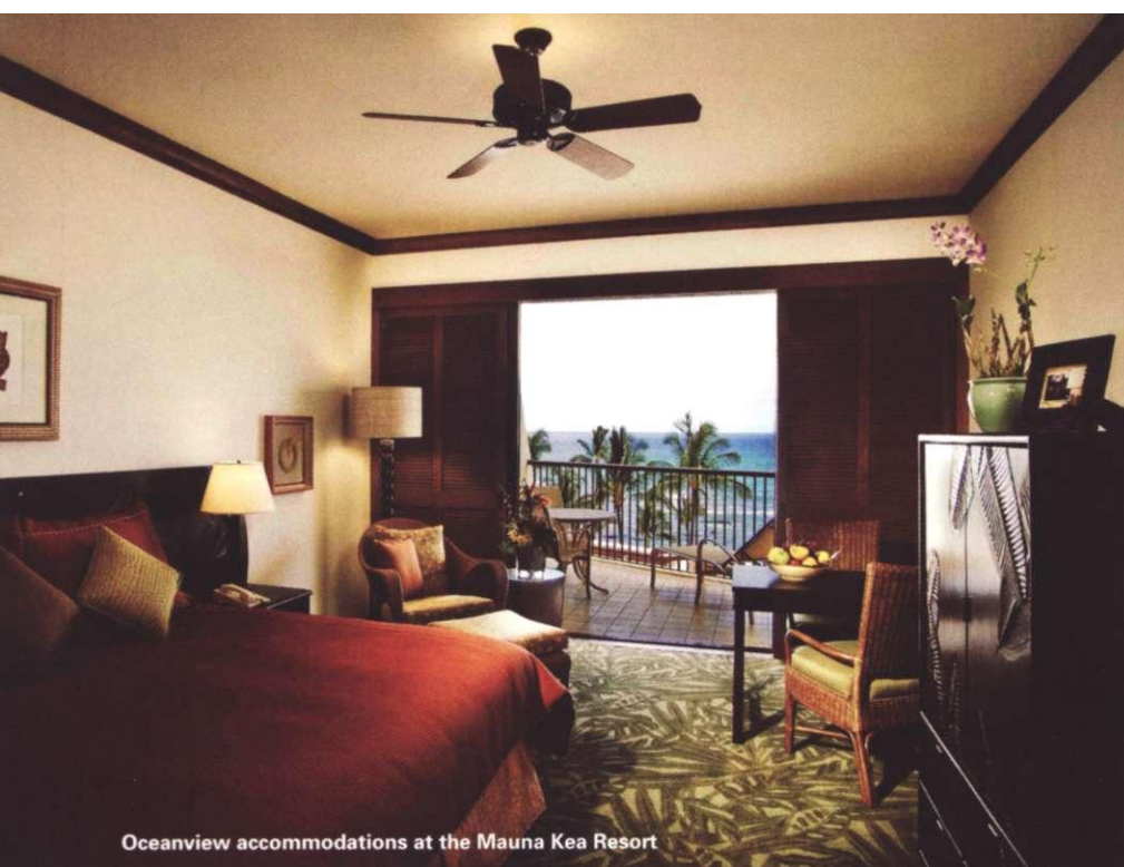
Oceanview accommodations at the Mauna Kea Resort