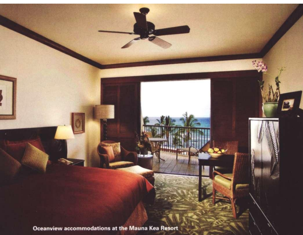
Oceanview accommodations at the Mauna Kea Resort