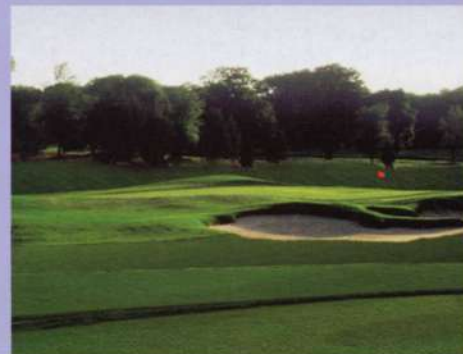
VAQUERO CLUB, located between Dallas and Fort Worth, Texas, offers 282 homesites on 525 acres, a 30,000 square-foot clubhouse featuring Texas Hill Country themes, and an 18-hole Tom Fazio-designed course.