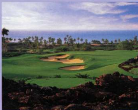
KUKIO GOLF & BEACH CLUB, on the Kohala Coast of the Big Island of Hawaii, is a 1,200-acre golf community with 375 homesites, a private 18-hole course and a 10-hole short course by Tom Fazio.