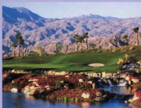
THE HIDEAWAY, a private community in La Quinta, California, provides 36 holes of golf and a Spanish Revival-style clubhouse, the epicenter of social and recreational activities at the community.