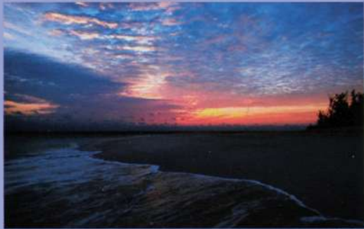
BAKER'S BAY GOLF & OCEAN CLUB, in the Abaco Islands of the Bahamas, is a 585-acre private community with over six miles of beachfront with a Tom Fazio-designed 18-hole course, a beach club and a private 180-slip marina.