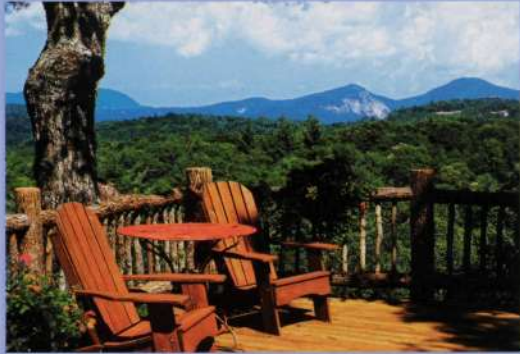
MOUNTAINTOP GOLF & LAKE CLUB, in the Blue Ridge Mountains of North Carolina, offers 250 homesites, 68 cabins and lodges with a Tom Fazio course, a private lake club, a southern mountain-lodge clubhouse, a spa, and lodging suites.