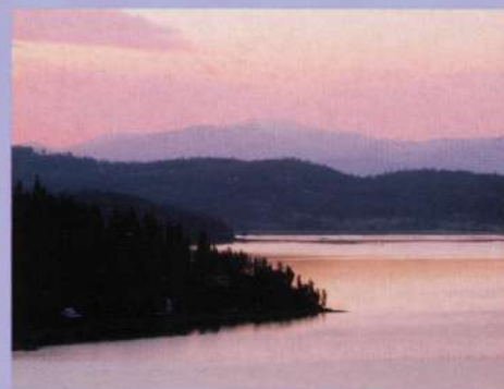
GOZZER RANCH GOLF & LAKE CLUB overlooks Lake Coeur d'Alene in Idaho. Its 665 acres offers 267 homesites, 34 cabins and 46 cottages. Amenities include club-owned watercraft, a marina, a Tom Fazio course, a mountain-lodge and kids' cabin.