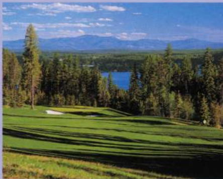
IRON HORSE GOLF CLUB, in Whitefish, Montana, is an 820-acre community with 316 member homesites, a masterfully designed 18-hole Tom Fazio golf course, and a 27,000 square-foot clubhouse.