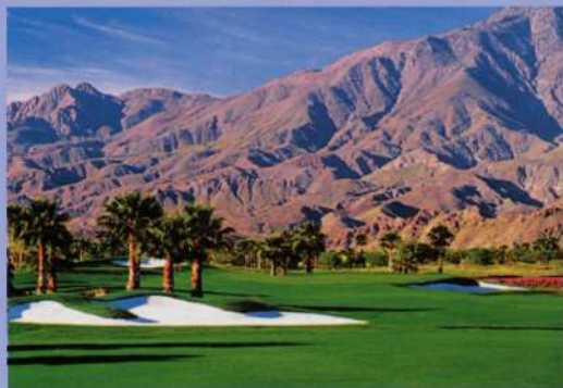
THE MADISON CLUB is located in La Quinta, California. The property offers 193 homesites and 27 golf villas spread across 500 beautifully landscaped acres with an 18-hole Tom Fazio-designed golf course.

wide range of amenities and activities built around natural surroundings.