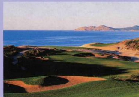
EL DORADO GOLF & BEACH CLUB, a 520-acre private beach and golf community in Los Cabos, Mexico, features a Jack Nicklaus course, a beach club and spa, beachfront homesites, golf and beach villas.