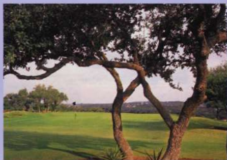
SPANISH OAKS, located in Austin, Texas, is surrounded by the natural beauty of the Texas hills. Its 1,200 unspoiled acres, bordering nature preserves, will offer 275 exclusive properties.