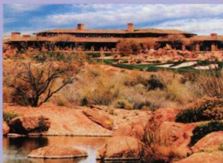
MIRABEL GOLF CLUB, in Scottsdale, Arizona, is a 713-acre development with 350 homesites and a beautifully appointed desert lodge clubhouse that features swimming, tennis, and first-class dining.