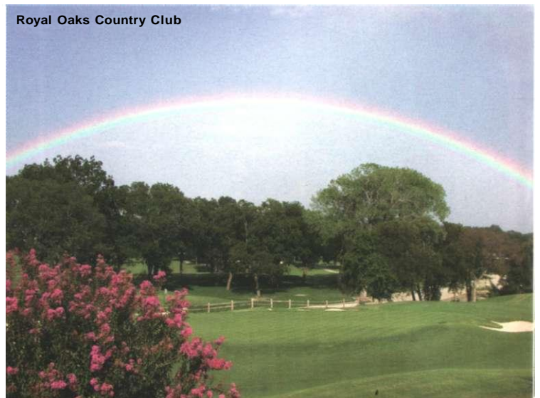
Royal Oaks Country Club

Dallas National notched 10s across the board for the golf course, conditions and its practice area. So it's no surprise that they ranked No. 1 for best golf experience. Dallas National is one of Tom Fazio's best designs, and the Zoysia fairways and Crenshaw L-93 Bentgrass greens are flawless. And no club has a practice area like Dallas National - the club even has a warm-up tee box that simulates the opening tee shot. The TPC Craig Ranch also has a wonderful practice area to go alongside its Tom Weiskopf design and plush course conditions. Many of golf's legends have worked on their games at Preston Trail,