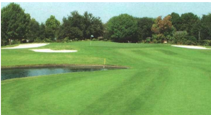
Ridglea Country Club

A club with an Arthur Hills course alongside a world-class Pete Dye course is a definite treat. But when those courses combine with a grand clubhouse and awesome tennis facilities, all for $10,000, it's a definite value. Such is the case with Stonebridge Ranch Country Club in McKinney. Following a close second is another 36-hole facility, Dallas Athletic Club. Jack Nicklaus designed both courses at DAC, and at $20,000 a membership here is a steal. Hackberry Creek reduced its initiation fees to $5,000, quite a bargain for a private club near the Las Colinas/Valley Ranch areas. Ridglea in Fort Worth offers a lot of country club for a mere $15,000. Besides two outstanding golf courses and a spacious clubhouse, Ridglea offers a great workout area and excellent dining facilities. Walnut Creek in Mansfield offers 36 good golf holes and excellent amenities, all for a meager $2,000.